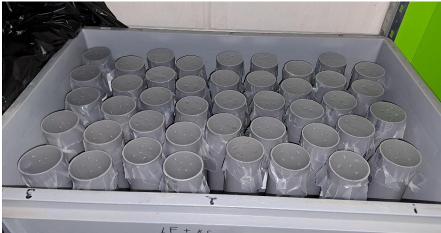
Figure 4: Tubes filled with soil and N-fertilisers in the soil incubation experiment

The fertilizing products, as well as the soil, were characterized and the N addition rate of these products to the tubes filled with soil was maintained as 170 kg N per ha. This value is based on the limit given in the Nitrates Directive (91/676/EEC) for manure products used as fertilizers in areas of Nitrate Vulnerable Zones.