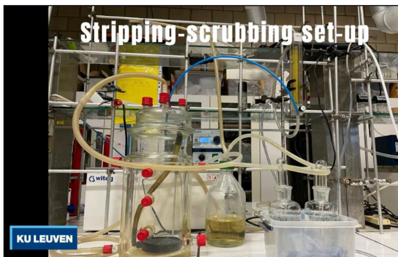
Figure 1: Stripping-scrubbing set-up, watch the experiment in action

After anaerobic digestion of dairy manure, the resulting digestate is passed through an air-assisted stripping unit, which strips out the ammonia. This ammonia gas is then scrubbed in an acidic solution to produce ammonia salts, which are essentially nitrogen fertilisers. The quality of these fertiliser products will be assessed by UGent. The test setup is shown in Figure 1.